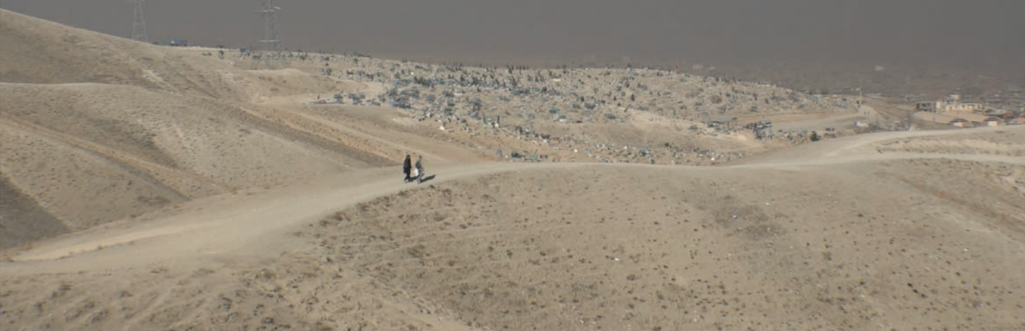
Haji Nabi Hills, Southwest Kabul, Afghanistan.

southern Afghan heartlands. This type of charisma was based not on eloquence or fiery soundbites, but rather by cultivating the perception of an otherworldly, selfless, guileless persona that seemed to many Talibs the antidote to the corrupted materialism around them. The contrast to the worldly Osama bin Laden could not be greater. In this sense, the story of Mullah Omar shows us just how different the Taliban and al-Qaeda really are. Today, as the prospect of peace hinges, in part, on trusting whether the Taliban can indeed split with al-Qaeda, understanding Mullah Omar's story is more crucial than ever.