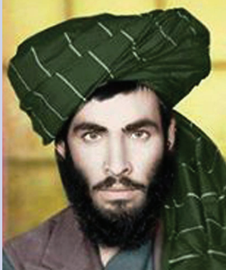
Clockwise from right: Mullah Omar in 1978, 1992 and 1996.